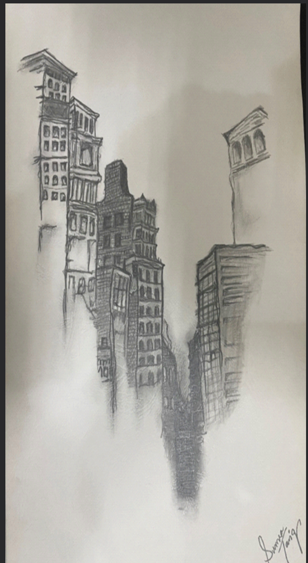
Computer Engineering Department, Session 2023 - A Student's Drawing titled, 'Palestine'

UET Lahore, in collaboration with the UET Literary Society, UET Debating Society, and Environmental Horticultural Society (EHS) celebrated the Art and Culture Week titled, NAQSH'23. This cherished mega event includes a vast number of intra-varsity competitions. NAQSH'23 comprised of different modules, including Qirat (recitation), Na'at (eulogizing Prophet Muhammad (SAW)), Urdu Afsana (short story), English Short Story, Quiz Competition, Live Sketching, Bait Bazi (poetry recitation), English Declamation, Urdu Declamation, English Poetry, Urdu Nazm, Urdu Ghazal, and Poster Designing. The event continued for two days. At the closing ceremony, students entertained the participants with their musical performances, and the event ended with the distribution of shields, certificates, and prizes among guests, participants, and winners.